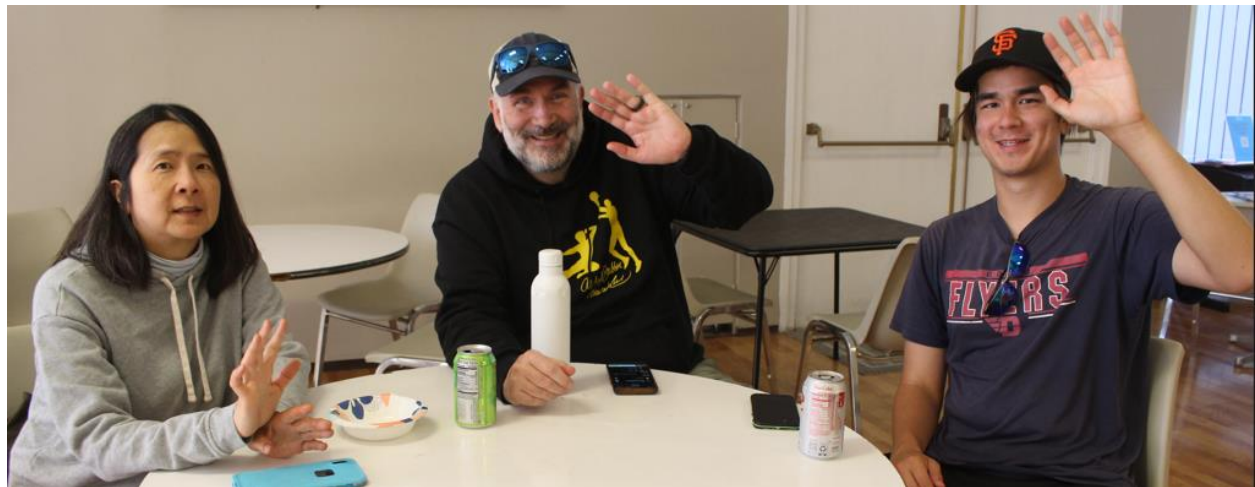
Invited Attendee Family