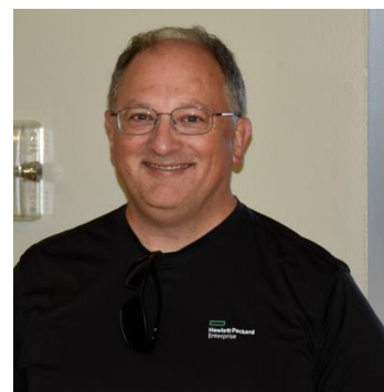
Invited guest attendee