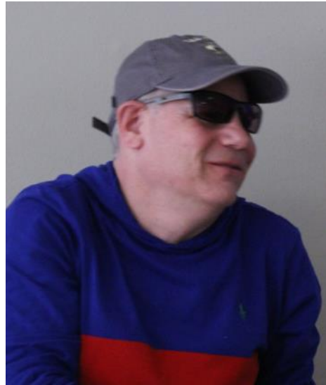
Invited guest of an attendee