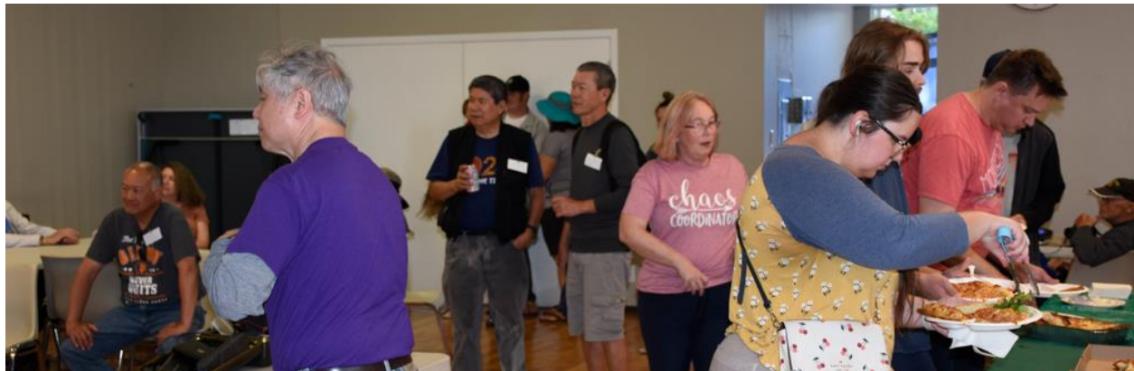
Photo of folks getting the delicious food