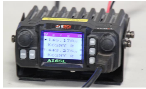
Raddioddy QB25 in field day use