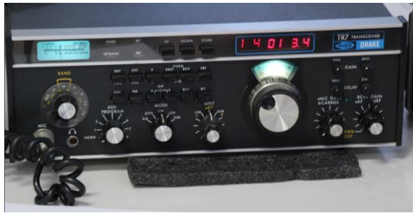
Drake TR7 transceiver during field day