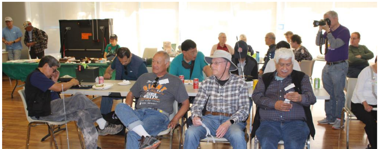
Folks checking their raffle tickets as the results are being announced