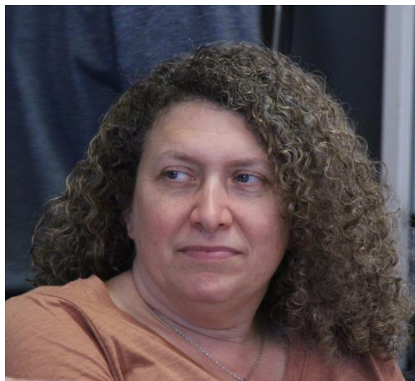
Invited guest of an attendee