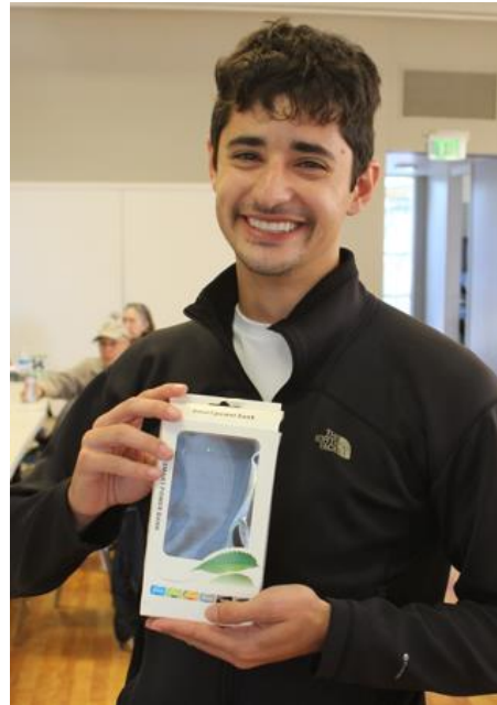
Jean Ralph - KO4ORJ:4 amp hour USB power pack