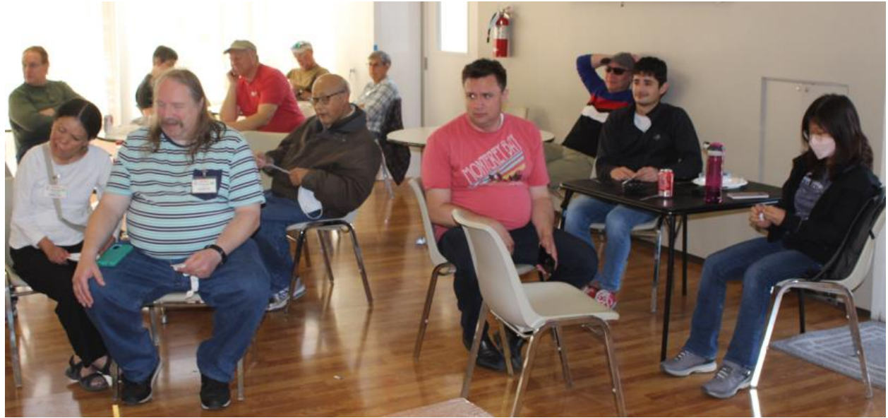
Folks anxiously awaiting the start of the raffle