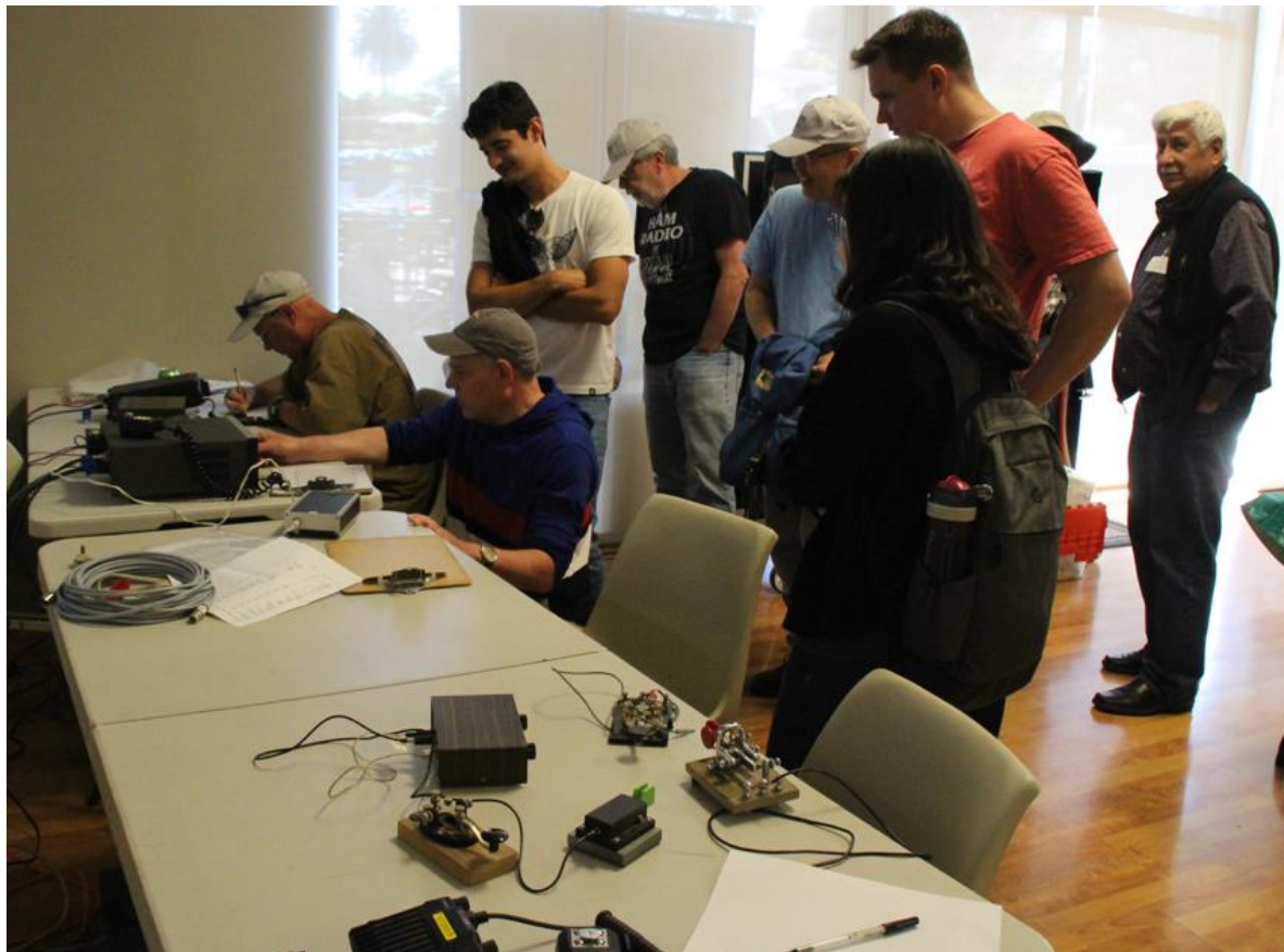
Crowd observing field day contacts in progress