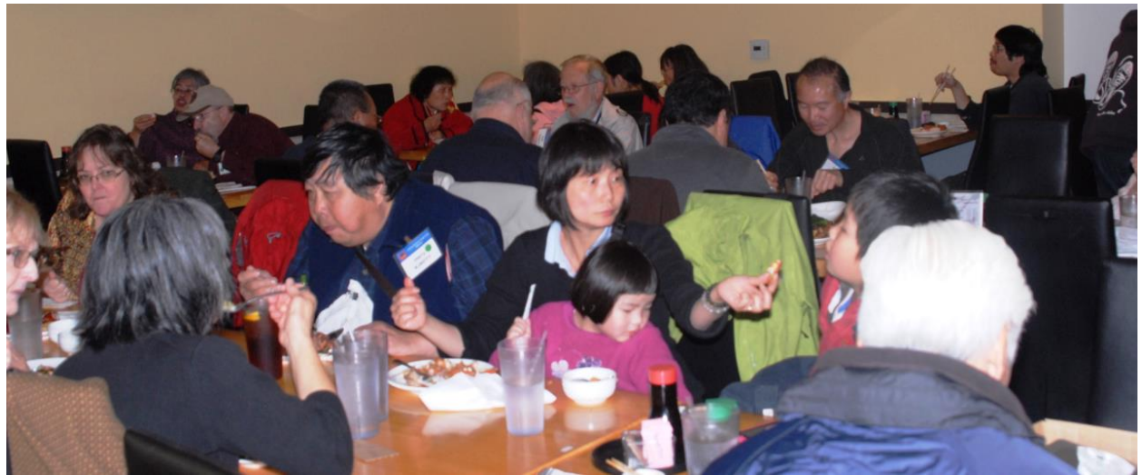
Several CARC Members having lunch.