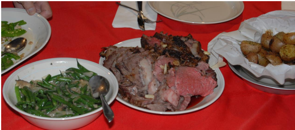
Some of the wonderful plentiful food at the party!