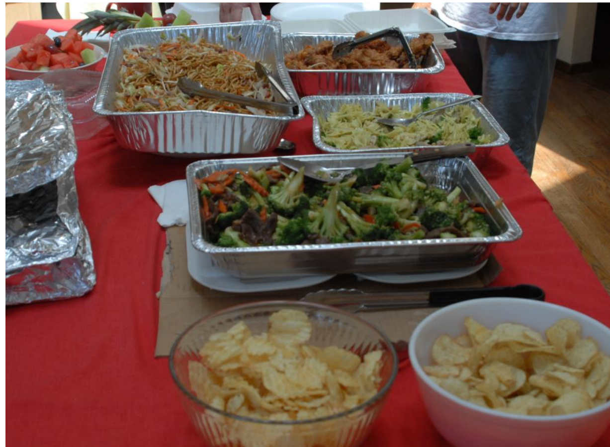
Picture of the wonderful food that everybody brought to the Field Day Party

Below are some of the pictures from our club potluck luncheon: