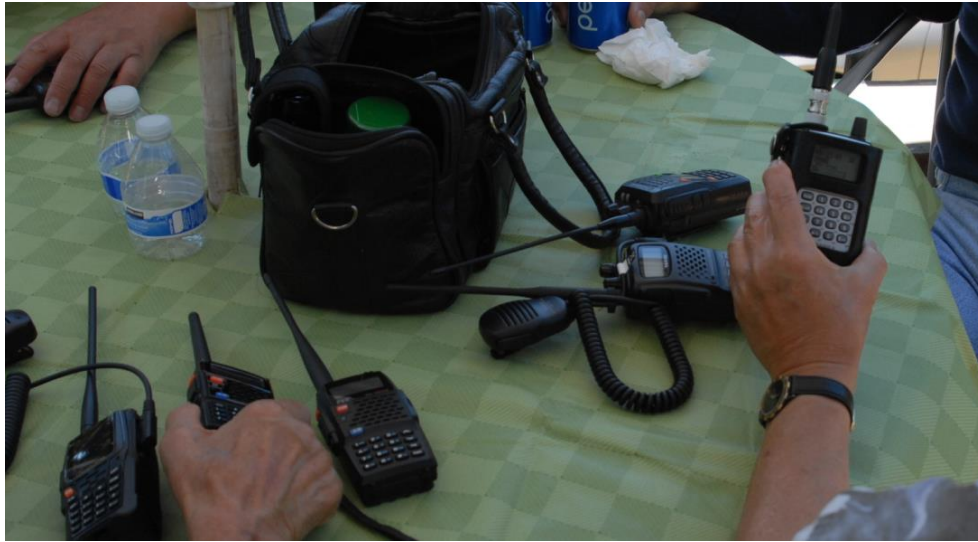
Checking out the many different radios that Gilbert-KJ6HKD brought for a show and tell