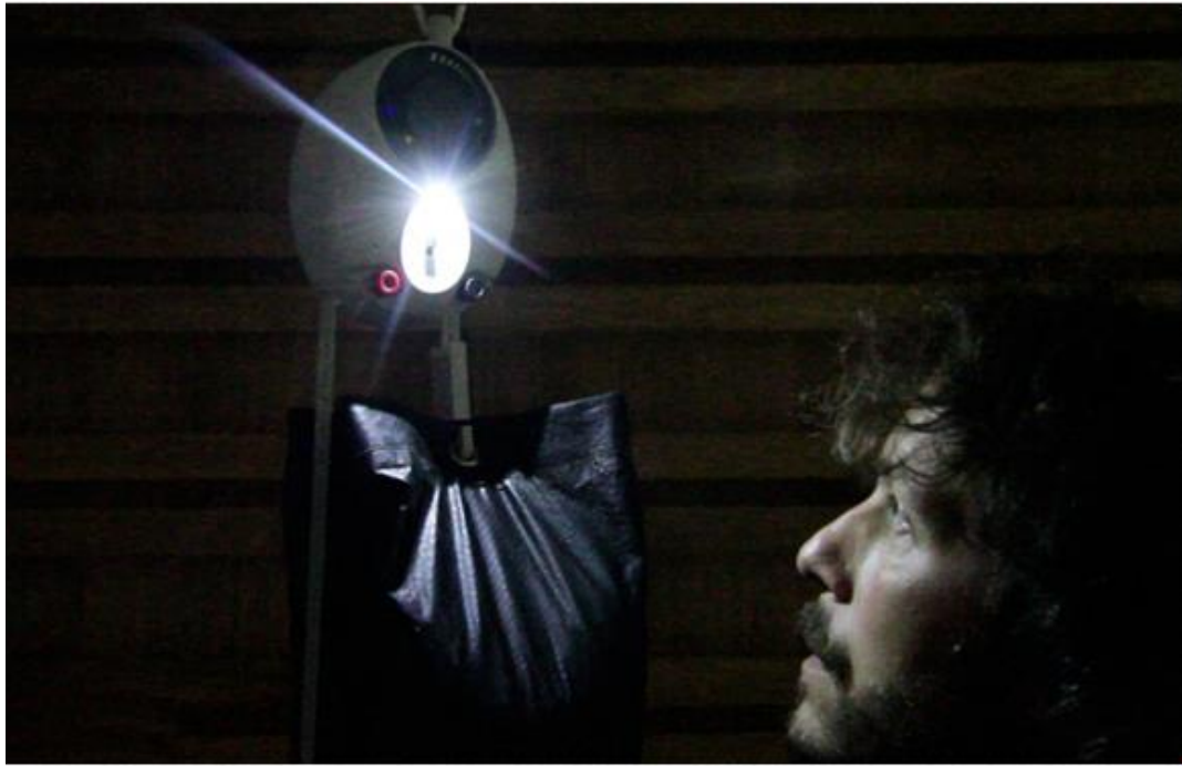
Lift the weight and let gravity do the rest.

The World Bank estimates that, as a result, 780 million women and children inhale smoke which is equivalent to smoking 2 packets of cigarettes every day. 60% of adult, female lung-cancer victims in developing nations are non-smokers.