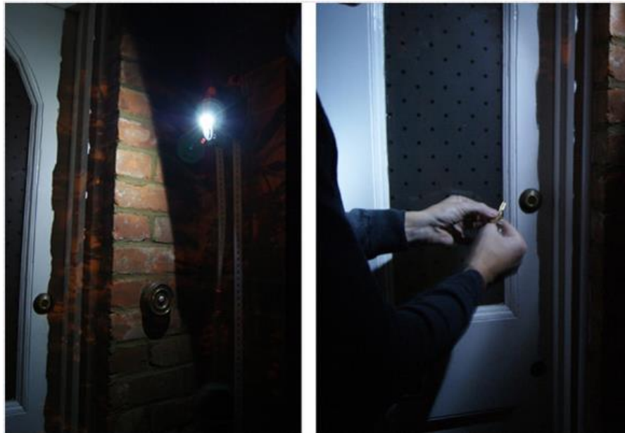
No batteries to drain or replace.