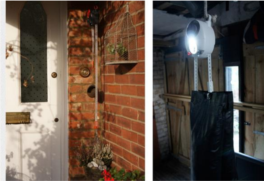
Hang it in the shed or make it into a great porch light, you can clip on a hanging basket or anything weighing about 20lbs.