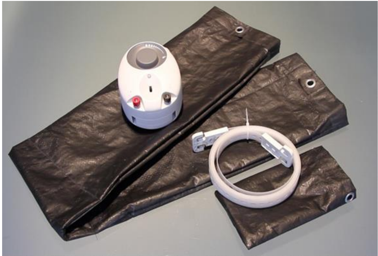
final prototype with ballast bag and bits.