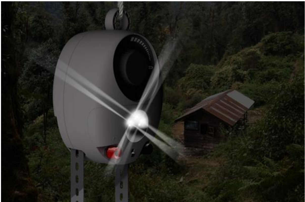
LED bulbs do not attract mosquitos like conventional bulbs

Lower cost self-contained lamps are becoming more widely available, but batteries are the weak link, because they are expensive and deteriorate through use and over time.