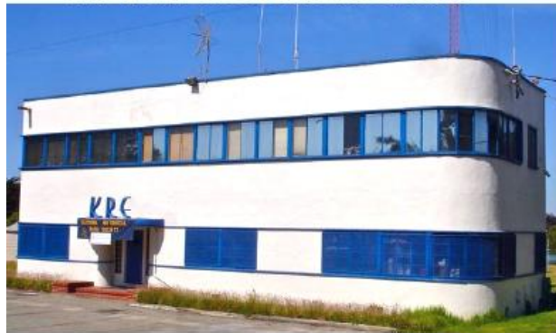
KRE 2012 - after CHRS Restoration

For additional information see: http://www.californiahistoricalradio.com/