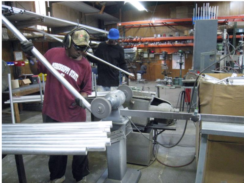
MFJ Enterprises antenna manufacturing shop in action