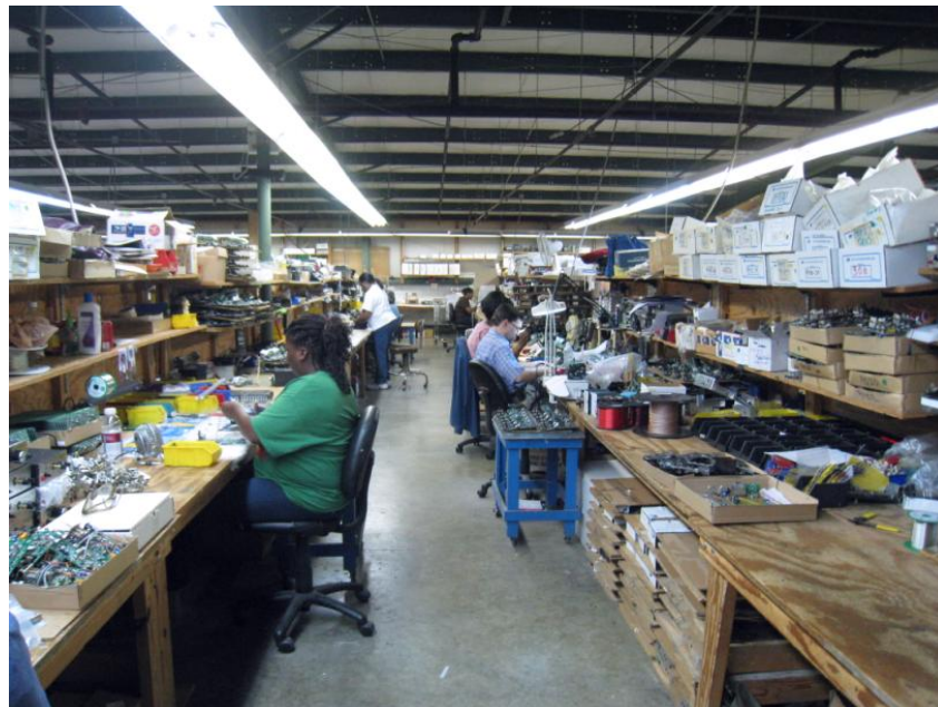
MFJ Enterprises assembly work bench area where electronic components are assembled and individually hand soldered.