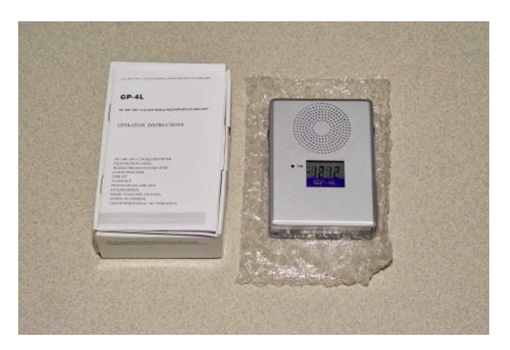
The GP-4L is one of the greatest portable radios I have ever run into. It has a digital AM/FM, shortwave radio, including WWV. It has a LED white flashlight and a complete clock radio. All in a small package. No wonder it was rated as the best pocket radio around by Popular Communications. You will end up taking this radio to wherever you go.

How about a power inverter for those blackouts and camping trips? It can run your laptop from your car without that expensive 12v adapter. A must have for emergencies.