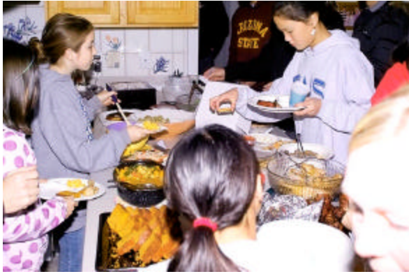
As usual, there was plenty of food, but are those potential HAMs? I'm going to work with them this summer.