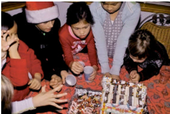
Here are the kids working on the ginger bread house. Several of these harmonics are "almost" ready to take the exam. This summer for sure.