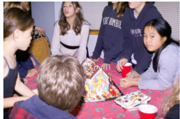
Here's the gingerbread house just before it was eaten up.