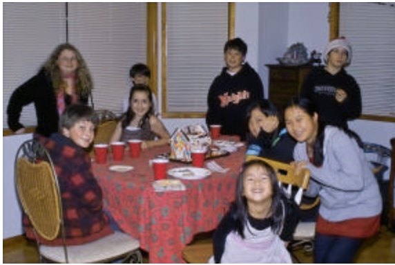
These kids are growing up. I don't even know their names anymore.