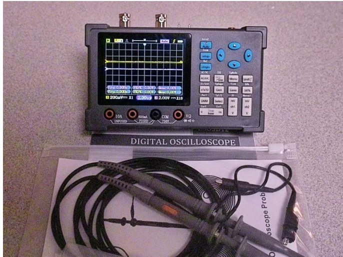
DSO03D12 120 MHz dual trace scope with probes - features a built in DVM , Signal generator, and FFT spectrum analyzer.