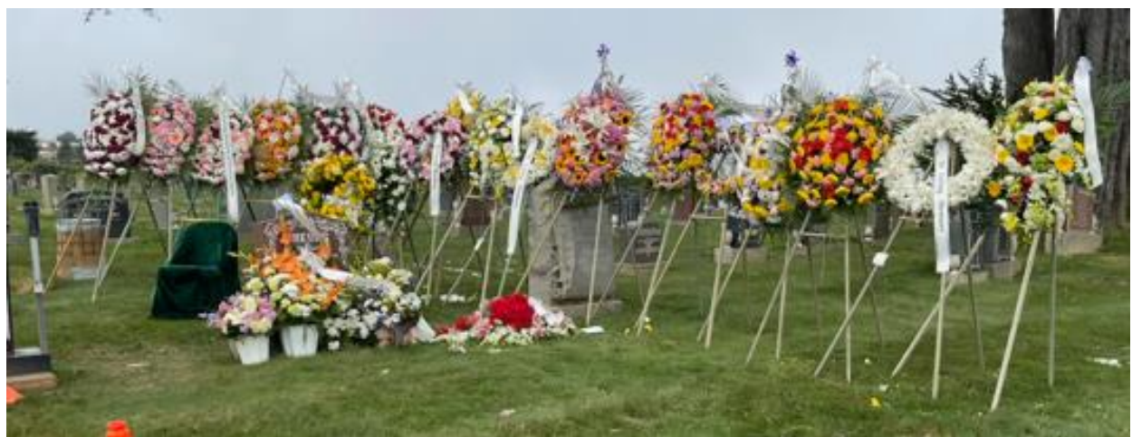
Flowers at the grave site