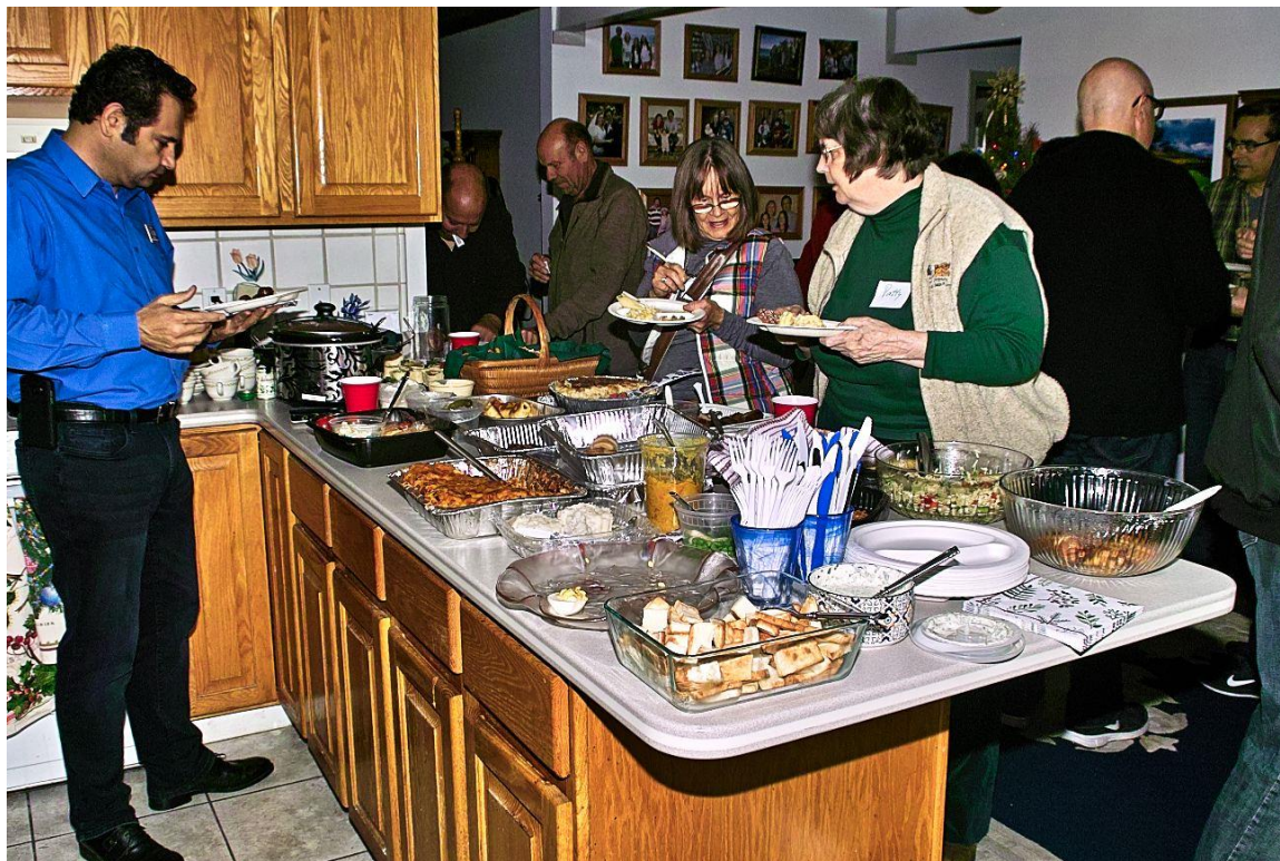
Just some of the food at previous year's Christmas Party.

There is no excuse not to attend. Not only that, it is FREE to all attendees. Just bring a dish to share. If you have ever been to our Cathay Radio Christmas Party, you know this is the event to taste foods from all over the world. Does not matter whether you like – barbecue ribs, salads, seafood, Chinese, Mexican, Italian, Korean, it will be there. All kinds of desserts served at the dessert table. Get ready to eat your heart out and meet new friends as well.