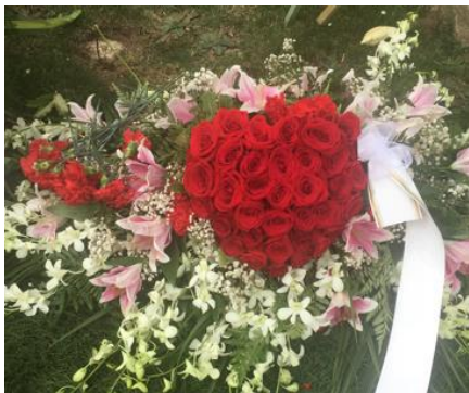
One of many beautiful flowers at the memorial