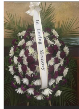
Another gorgeous wreath among the many at the memorial.