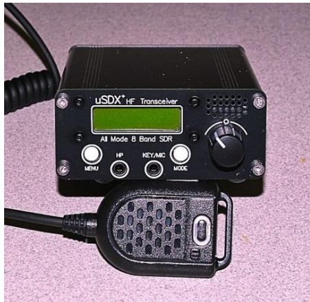
uSDX+ - QRP HF transceiver - Covers 160-6 meters – SSB, CW, digital QRP transceiver. 5 watts CW – 10 watt SSB. Built in CW decoder, full DSP noise reduction. Complete with 4000 MaH LiOn battery, AC adapter/charger, Speaker/microphone

Includes cables and full calibration kit.