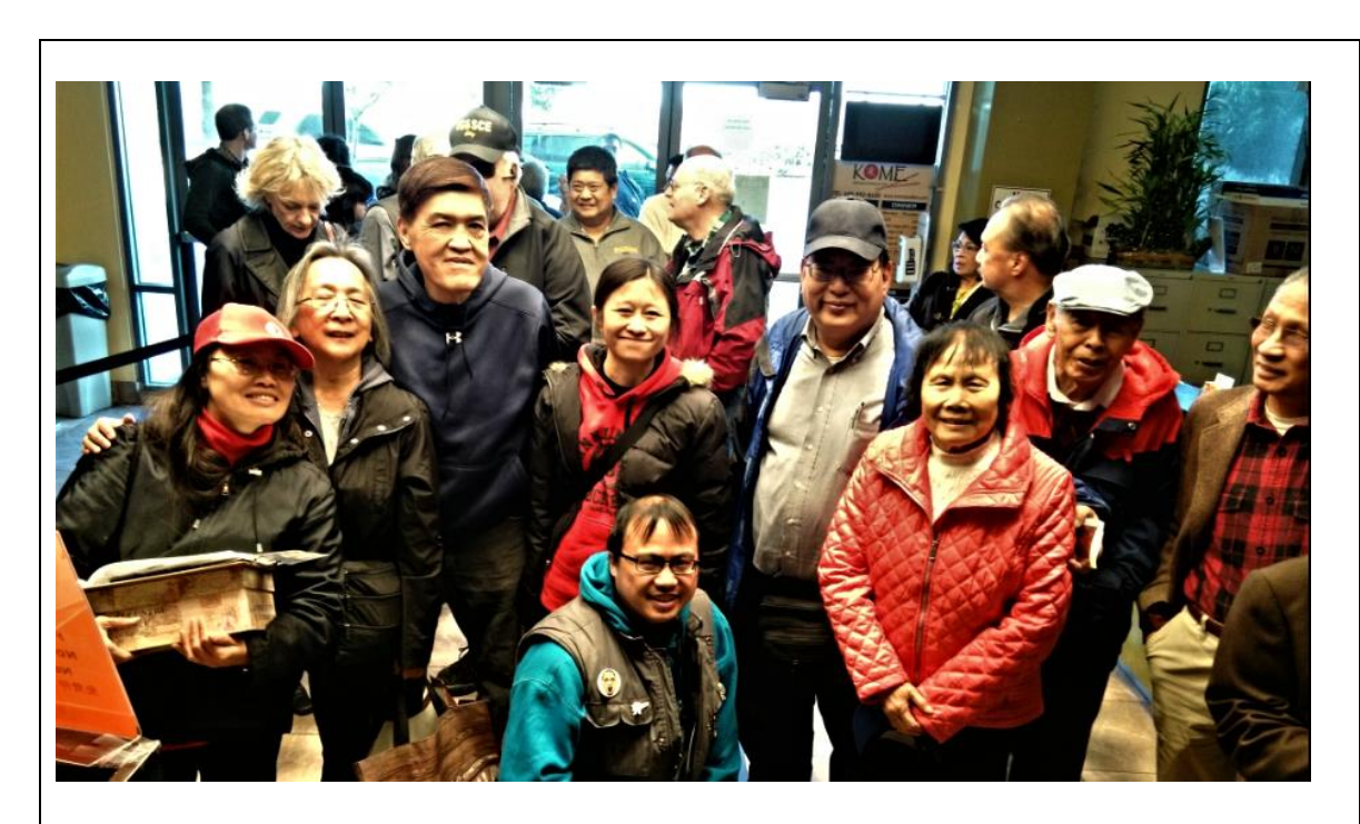
Group photo just before start of the luncheon.