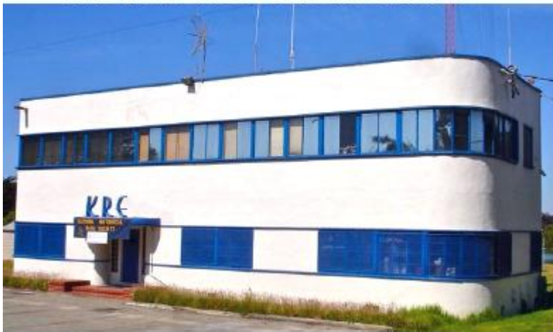
KRE 2012 - after CHRS Restoration

For additional information see: http://www.californiahistoricalradio.com/