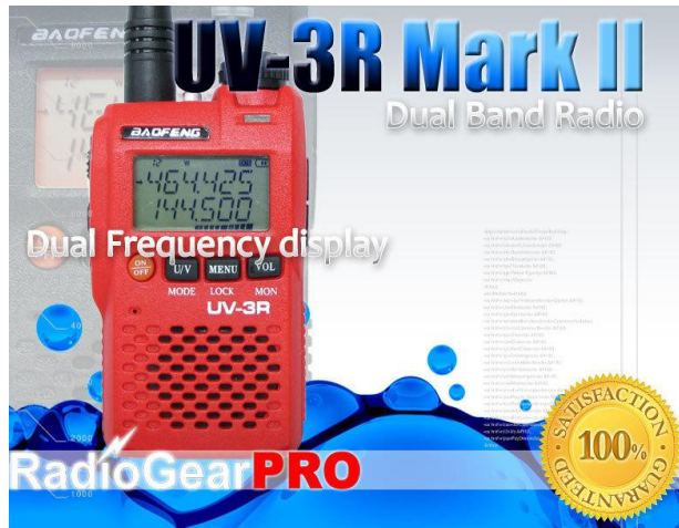
BaoFeng UV-3R Mark II - Red