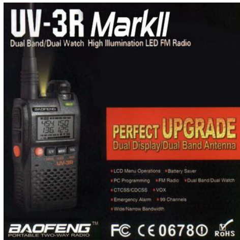
BaoFeng UV-3R Mark II - Black