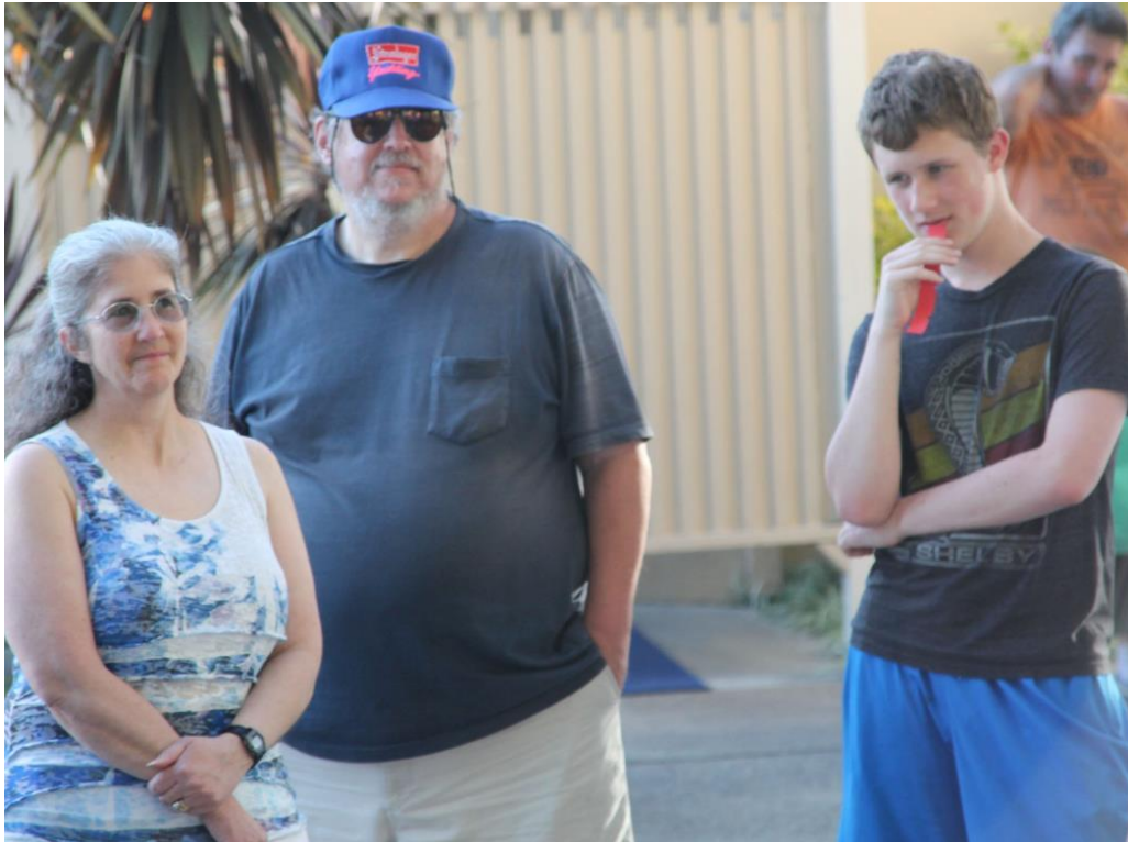
Folks during the raffle and anxiously awaiting the results.