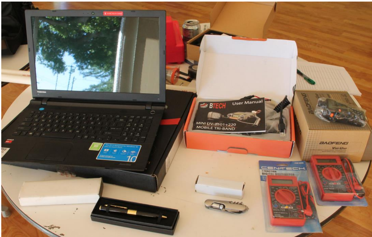
Raffle Prizes for the event.