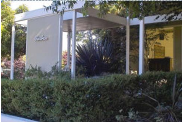
Front entrance: Fairbrae Swim and Tennis Center