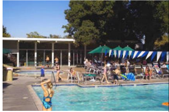
Swimming Pool at the Fairbrae Swim and Tennis Center