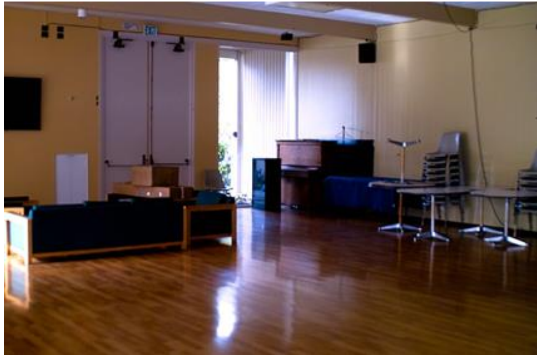
The Recreational Room at the Fairbrae Swim and Tennis Center.