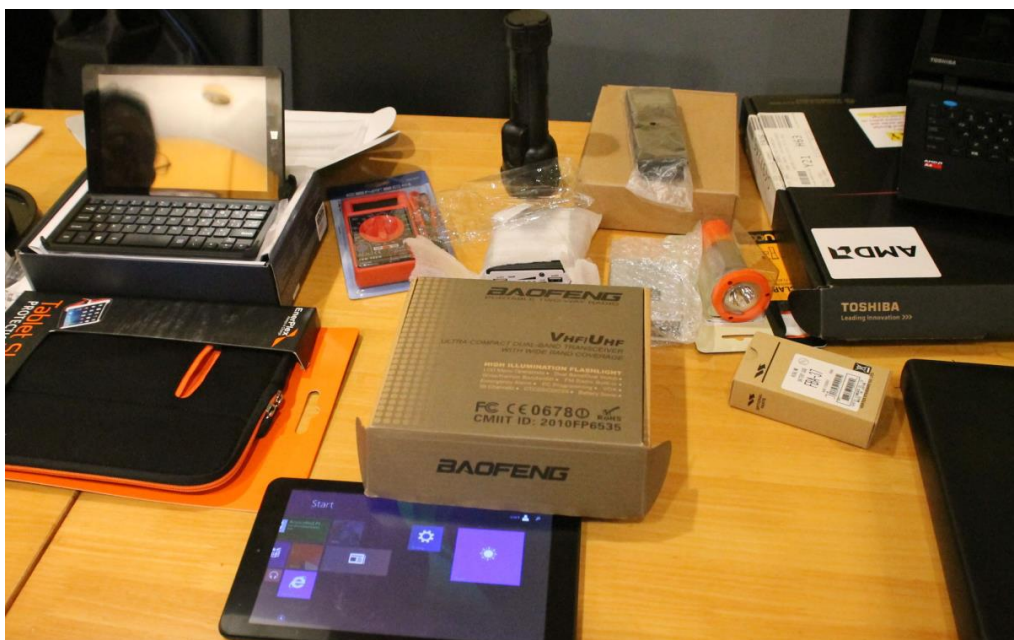
Raffle prizes setup on the table (note: Apple Ipad was not part of the raffle)