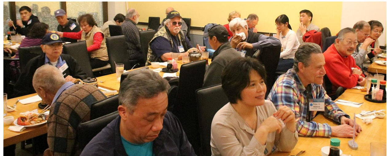
Luncheon Guest awaiting the raffle to start