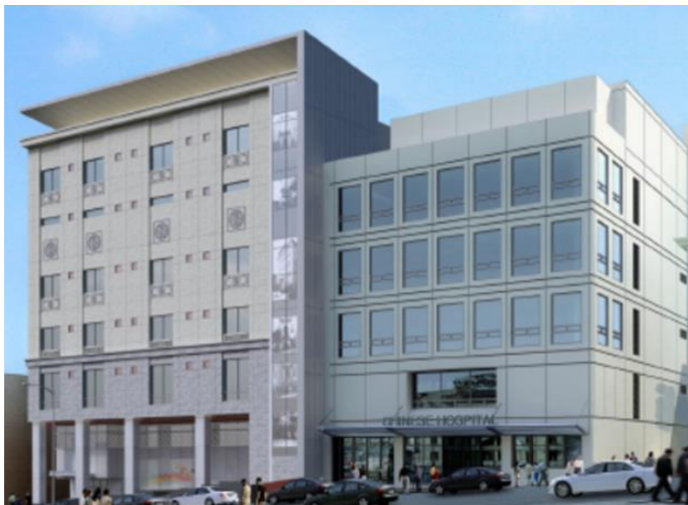
Left to right: New Chinatown Hospital Patient tower and the current Chinese Hospital