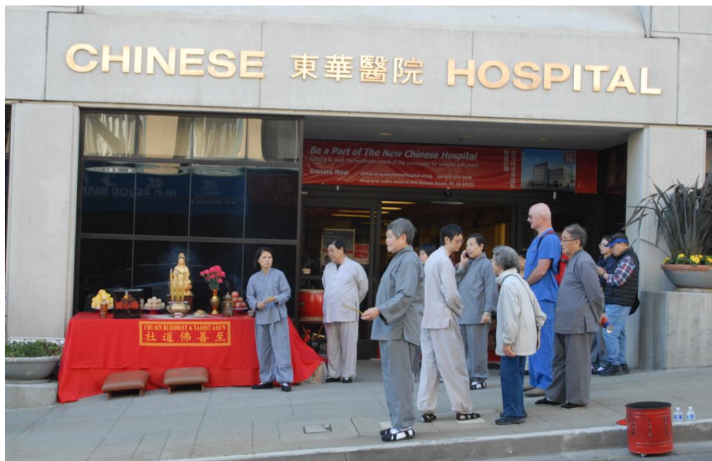
Buddhist blessings for the new Chinese Hospital Patient Towers.