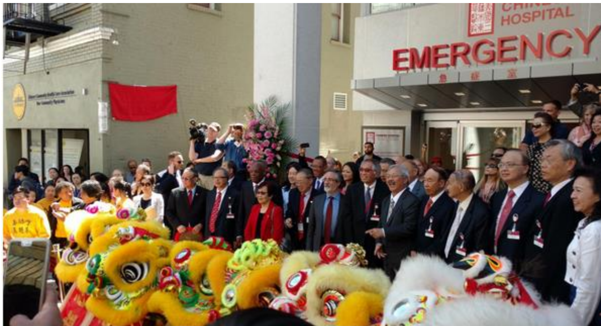
Chinese Hospital ribbon cutting group photo

A police presence kept the festivities both relaxed and orderly.