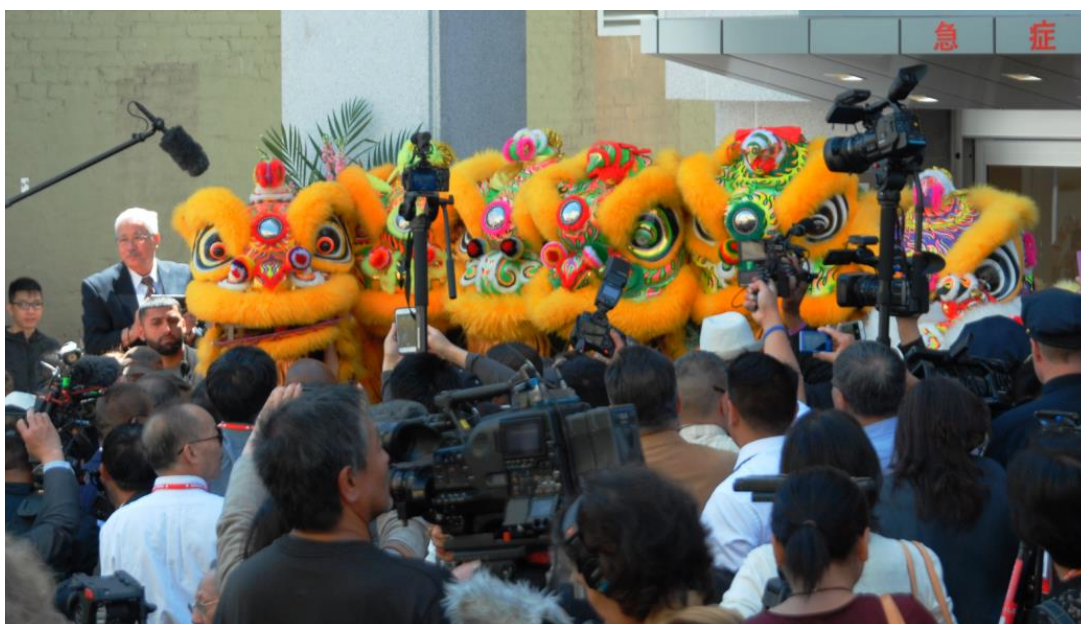
Chinese Lion dancing to commemorate the new Chinatown Hospital Patient Tower opening.