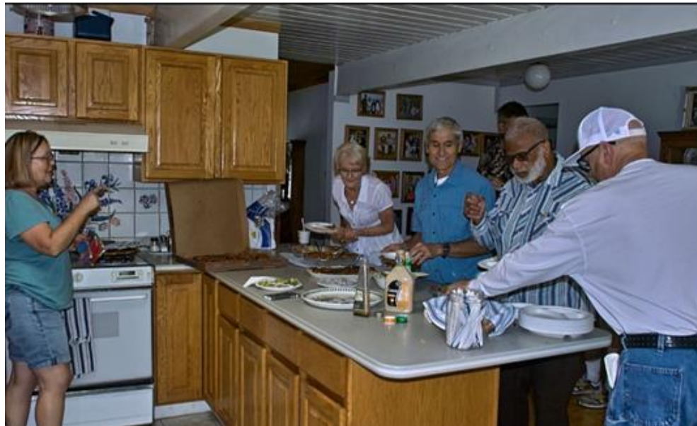
Folks loading up on the food that was plentiful.