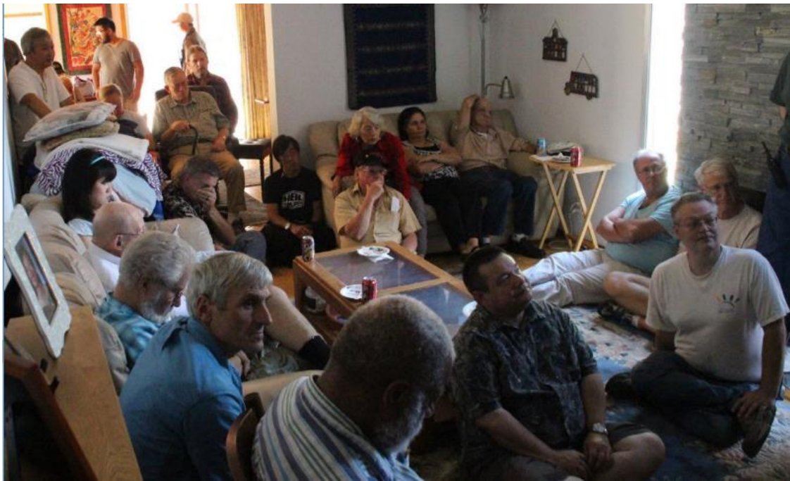
Additional pictures of attendees in the “Pack House”.