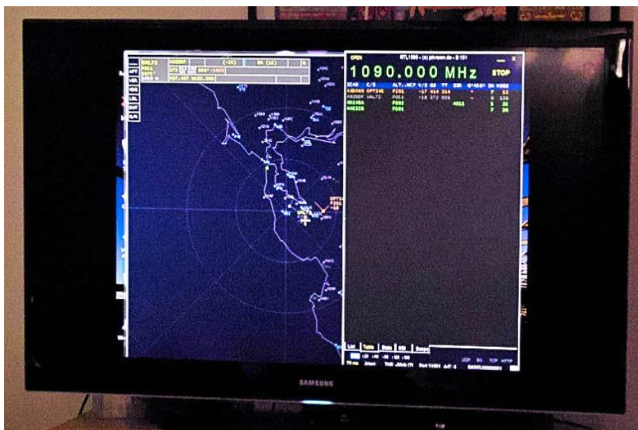
One of the real time displays from the SDR's on a PC