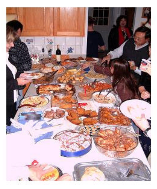
This was just a small sample of the many varieties people brought. Foods from all over the world. Chinese, Italian, French, American, Japanese etc.. I'm sure everyone left experiencing something new.