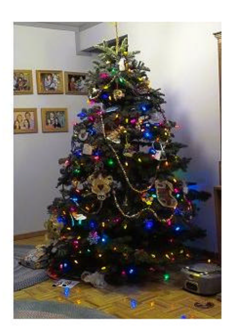
This christmas tree has 200 color LED's runned on a 12V 7 AmpHR gelcel. It's very "green".