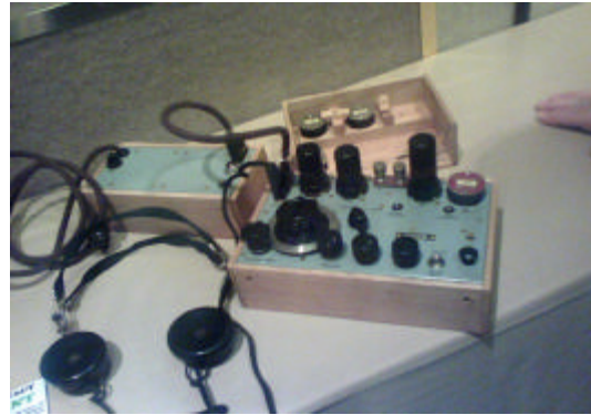
A replica of a para radio used by Allied Forces during WWII was at the QRP forum Friday evening.