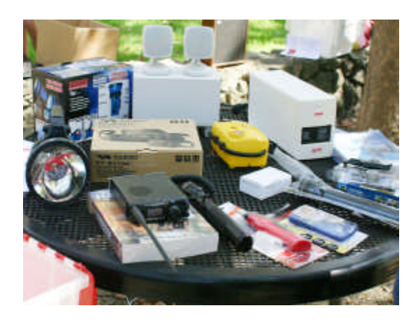
Over $1000 worth of raffle prizes.